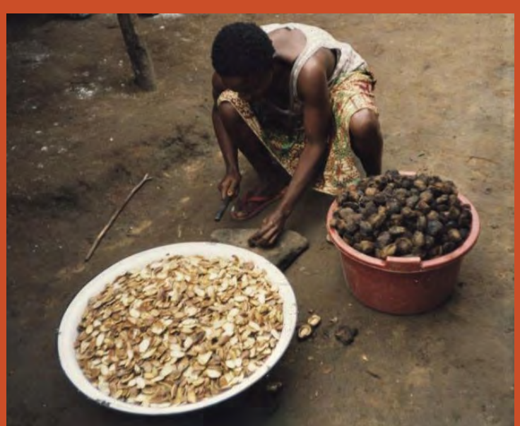
Breaking bush mango nuts, Takamanda village, Cameroon.

For centuries, bush mango fruits have been used for subsistence purposes and sold. Multiple plant parts are utilised for medicine, to make utensils and mortars, for roof supports, to make dyes, and in other products, but the seeds provide the most important product, as a thickener for soups and stews. Bush mango is one of the most widely traded forest products in