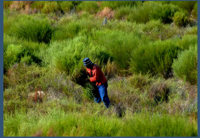
Rooibos harvesting in the Cederberg mountains, South Africa.

The agreement recognises the role played by TK in the development of the industry and allocates a "TK levy" calculated at 1.5% of the price that processors pay to farmers per kilogram of harvested rooibos. After being deposited into the government's bioprospecting trust fund, the levy is to be paid in equal parts to the San Council and National Khoisan Council. While a TK levy can never erase colonial violence, representatives in the organisations have expressed that the ABS agreement went a long way towards recognising San and Khoi as peoples who possess a deep connection to the rooibos land.