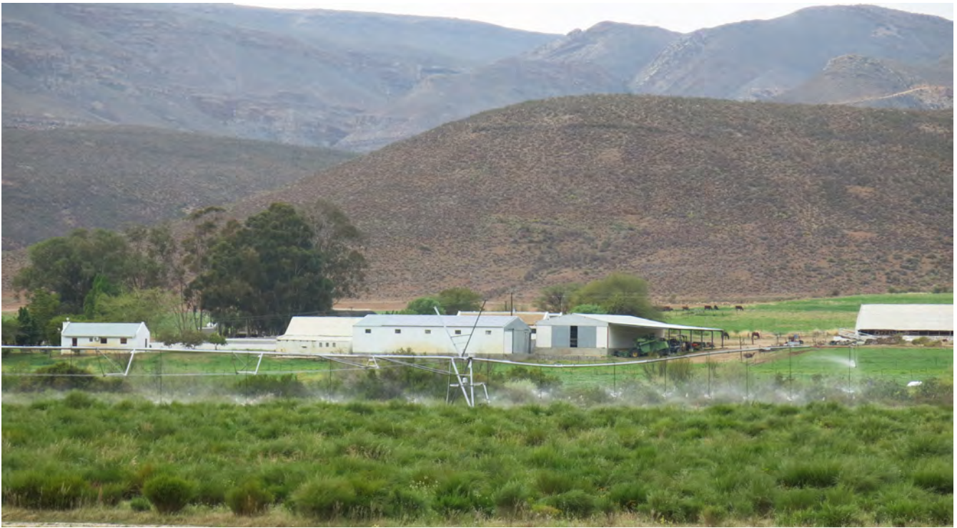
The environmental impacts of rooibos cultivation can be significant. Irrigated rooibos fields in the Cederberg in the midst of one of the most severe droughts in recorded history.