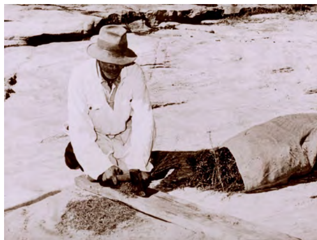
Traditional method of chopping rooibos tea with axes and bruising it with wooden mallets against rocks.

With the onus on the state to “prove” such claims, the then Department of Environmental Affairs (DEA) (now the Department of Environment, Forestry and Fisheries - DEFF) commissioned research to investigate the ethnobotanical use of rooibos. The report concluded that “there is no evidence to dispute the claim by the San and the Khoi people of South Africa that they are the rightful holders of traditional knowledge associated with rooibos”. The DEFF urged any individual or organisation involved in bioprospecting or biotrade using rooibos species to engage with the Khoi or San communities or people to negotiate a benefit-sharing agreement in terms of the Biodiversity Act and the BABS Regulations.