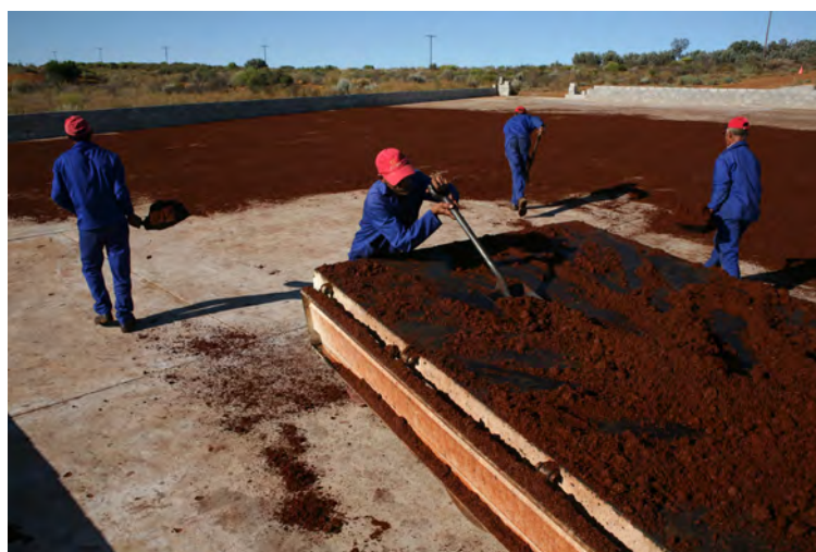
Processing rooibos in the tea court.

Regulating biotrade is important from a biodiversity conservation perspective when the volumes are large and resource overexploitation is a concern. However, addressing these concerns requires measures quite different from those called for in bioprospecting and the utilisation of genetic resources. Elsewhere in the world, biotrade per se does not require benefit-sharing agreements and prior informed consent. A wide range of other measures and standards such as Fairtrade, FairWild and ethical biotrade aim to bring fairness to biotrade although much work remains to entrench equity in many natural product industries.