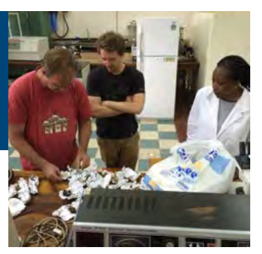
The project partners at work in Kenva