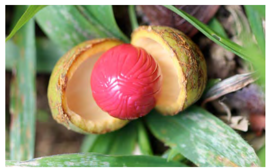
Murumuru Fruit Virola surinamensis Myristicaceae

SDG 8 , target 8.3: As demonstrated above, the Fund supports the livelihoods of the communities through job creation, entrepreneurship based on sustainable harvesting of natural resources.