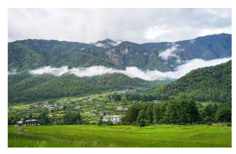
Mountain panorama in Bhutan

QPL successfully developed and placed on the market a cosmetic product containing extracts of Cymbidium erythraeum. Further, the company has successfully filed a first patent in Bhutan and has secured patents in a few other countries. The agreement included a clause which confirms that any intellectual property rights (IPRs) arising from it will be mutually discussed and agreed. The patent relates to the use of extracts for cosmetic skin treatments, in particular skin changes due to aging (e.g. wrinkles, loss of firmness and elasticity, and increased pigmentation). In line with its engagement but independent from the ABS case, QPL funds additional CSR projects in Bhutan for orchid propagation.