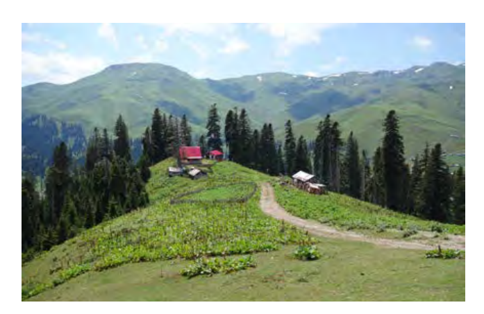
Mountain panorama in Georgia

and are involved in curricular development. The central laboratory of the consortium is located at Ilia State University (Tbilisi, Georgia). It is used by scientists from Germany, Georgia and Armenia, as well as from neighbouring countries, and will be open in the future to researchers from other countries equally interested in Caucasian biota.