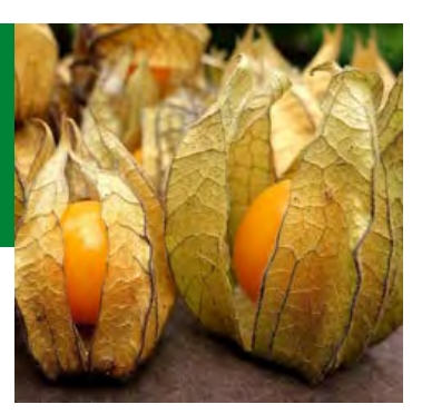
The Uchuva fruit and its calix