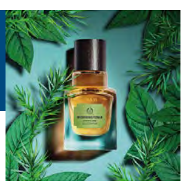
The Widdringtonia Eau de Parfum