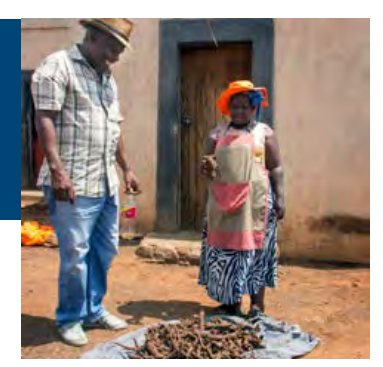
Pelargonium yield