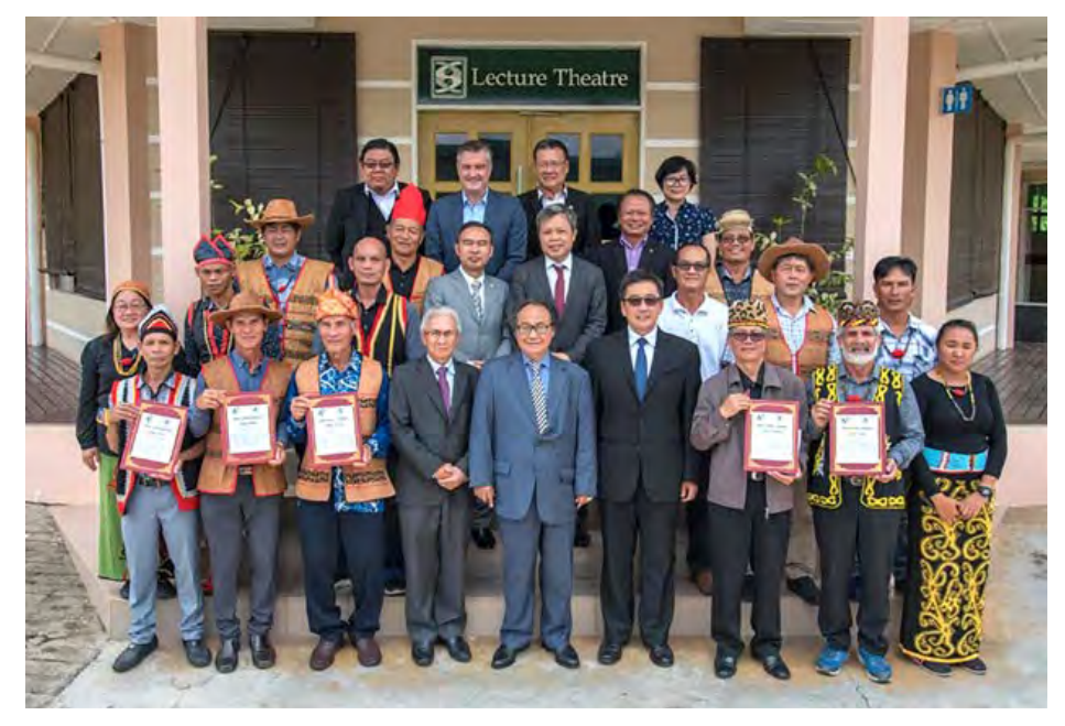
Completion of a benefit-sharing agreement signing

Non-monetary benefits include the empowerment of communities through capacity-building and the establishment of facilities for essential oil distillation. SBC has trained communities on plant propagation and sustainable harvesting through Good Wild Craft Practice (GWCP). As a result, communities are conserving the plant resource and the areas where these plants are found. Through co-funding from SBC and GEF/UNDP, a distillation shed was built in the communities and distillation equipment was provided. In exchange, the communities have committed to supply a certain amount of oil. According to some news articles, 40 litres of the essential oil were supplied to SBC in 2019 and it takes 130kg of leaves or 30kg of fruit to produce one litre of oil. Out of a population of 200 to 500 people per village depending on the village, approximately 8 to 22 people are involved in oil production.