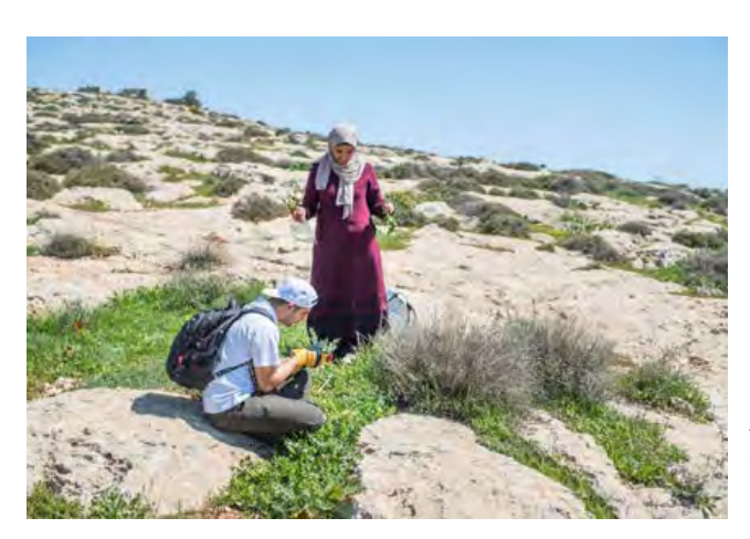
Joint collecting expedition by NARC, SBR and RBG Kew in Jordan to collect plant material of G. tournefortii for analysis and training.

In the near future (pending further funding), the study will involve seed collection and conservation and plant propagation activities, as well as support the development of marketable produce and products as a consequence of their promotion. In Lebanon, this project links to existing activities carried out by the Shouf Biosphere Reserve related to the sustainable harvesting of edible wild plants, in addition to their production with other local crop varieties and the restoration of agriculture traditional terraces.