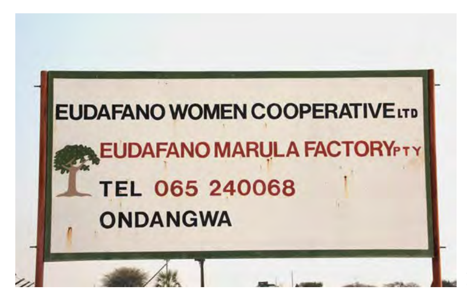
Eudafano Women Cooperative

In the absence of clear ABS regulation, the law on contracts, including intellectual property rights (IPRs), was applied alongside other development objectives to generate benefits for the local producers (including co-ownership through commercial associations). The co-owned patent, which was only filed and granted in France, created transparency and allowed further development of the value chain without the danger that other market players would later file patents restricting use of the oil.