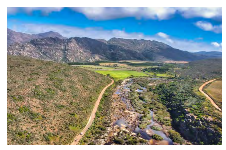
Landscape between Citrusdal and Clanwilliam