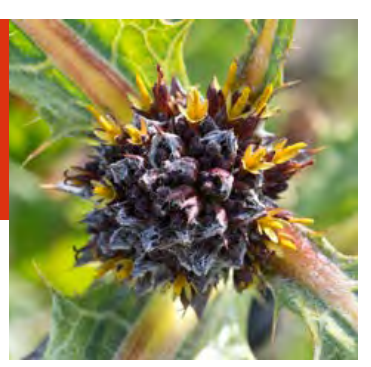
Close-up image of the wild edible plant Gundelia tournefortii