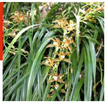
The orchids

OVERVIEW An ABS agreement for the use of orchids in ingredients for cosmetics.