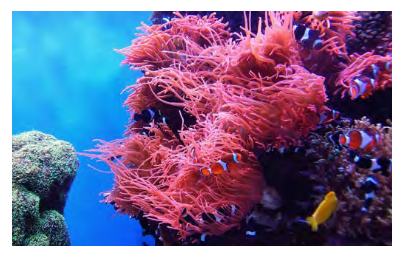
Coral reef

Furthermore, monetary benefits included a contribution to research funding for young researchers at USP. Other monetary benefits were its contribution to the Fijian economy in the form of its initial investment to the tune of approximately FJD 1 million in its first term from 2006 to 2009. Other monetary benefits included fringe benefits in terms of financial contributions made towards the lodging fees and logistical support for the teams including boat transport during their collections.